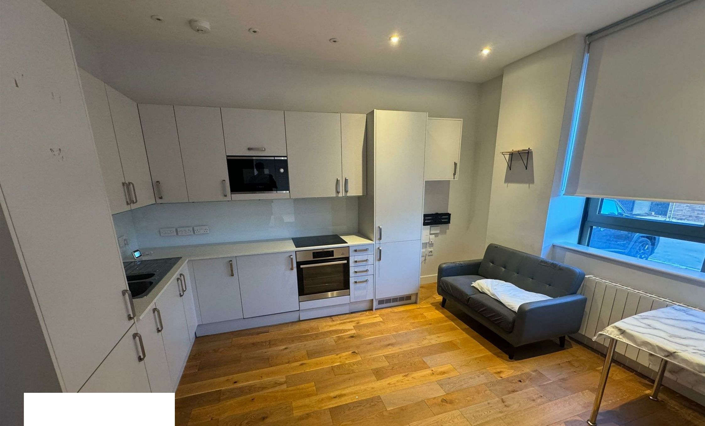
Flat 10 Archer Court, 21 High Street Feltham, TW13 4AG £1,300